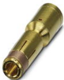
Crimp contact, turned, contact diameter: 3.6 mm, crimp range: 2.5 mm 2 ... 4 mm 2

Please be informed that the data shown in this PDF Document is generated from our Online Catalog. Please find the complete data in the user's documentation. Our General Terms of Use for Downloads are valid ( http://phoenixcontact.com/download )