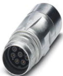
Coupler connector, straight, SPEEDCON locking, M17, Number of positions: 5+3+PE, Type of contact: Socket, Crimp connection, shielded: yes, Cable diameter: 5 mm...9.2 mm

Please be informed that the data shown in this PDF Document is generated from our Online Catalog. Please find the complete data in the user's documentation. Our General Terms of Use for Downloads are valid ( http://phoenixcontact.com/download )