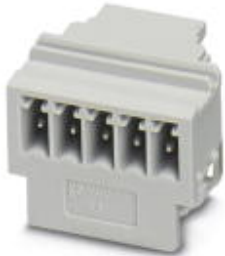
Header, Nominal current: 8 A, Rated voltage (III/2): 160 V, Pitch: 3.5 mm

Please be informed that the data shown in this PDF Document is generated from our Online Catalog. Please find the complete data in the user's documentation. Our General Terms of Use for Downloads are valid ( http://phoenixcontact.com/download )