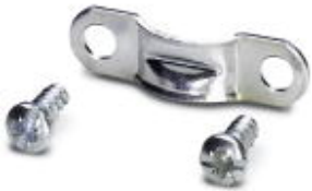
Strain relief clamp

Please be informed that the data shown in this PDF Document is generated from our Online Catalog. Please find the complete data in the user's documentation. Our General Terms of Use for Downloads are valid ( http://phoenixcontact.com/download )