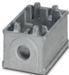
HEAVYCON-ADVANCE pedestal enclosure B 32, for increased environmental requirements, EMC-conductive, for Allen wrench screw locking, with 1x M32x1.5 cable outlet

Please be informed that the data shown in this PDF Document is generated from our Online Catalog. Please find the complete data in the user's documentation. Our General Terms of Use for Downloads are valid ( http://phoenixcontact.com/download )