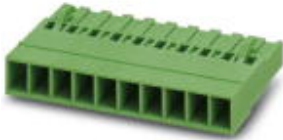
The illustration shows a 15-position version

Plug component, Nominal current: 12 A, Rated voltage (III/2): 320 V, Number of positions: 17, Pitch: 5.08 mm, Connection method: Crimp connection, Color: green, Corresponding female crimp contacts with current [A] and conductor cross section range [mm 2 ] data: 10A/MSTBC-MT 0,5-1,0 (3190564); 10A/MSTBC-MT 0,5-1,0 BA (3190645); 12A/MSTBC-MT 1,5-2,5 (3190551); 12A/MSTBC-MT 1,5-2,5 BA (3190658). BA = Bandkontakte