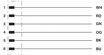
Contact assignment of 7/8" plug