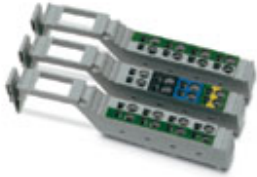
Connector set, for Inline input terminal blocks with AC voltage

Please be informed that the data shown in this PDF Document is generated from our Online Catalog. Please find the complete data in the user's documentation. Our General Terms of Use for Downloads are valid ( http://phoenixcontact.com/download )