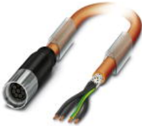
Cable plug in molded plastic, Length: 5 m, Color of outer sheath: orange RAL 2003

Please be informed that the data shown in this PDF Document is generated from our Online Catalog. Please find the complete data in the user's documentation. Our General Terms of Use for Downloads are valid ( http://phoenixcontact.com/download )