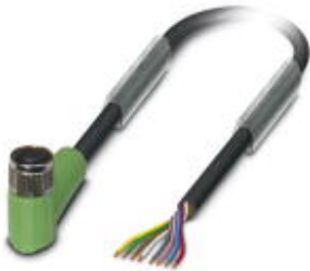
Sensor/Actuator cable, 8-position, PUR, Black RAL 9005, Free cable end, on Socket angled M8, Cable length: 3 m

Please be informed that the data shown in this PDF Document is generated from our Online Catalog. Please find the complete data in the user's documentation. Our General Terms of Use for Downloads are valid ( http://download.phoenixcontact.com )