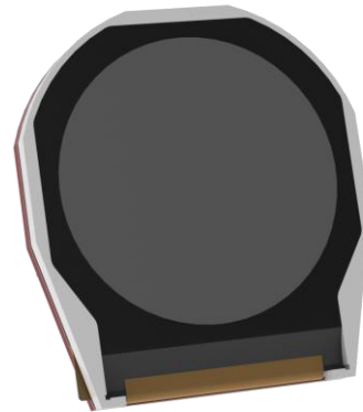
The uLCD-220RD Display Module

NOTE (*): Arduino remains the property of the Arduino Team. All references to the word Arduino and Arduino Hardware are licensed under the Creative Commons Attribution Share-Alike license.