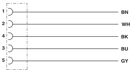
Contact assignment of the M12 socket