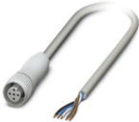
Sensor/Actuator cable, 5-position, PP-EPDM halogen-free, Gray RAL 7035. Free cable end, on Socket straight M12, A-coded, Cable length: 10 m, Hygienic design, with plastic knurl

Please be informed that the data shown in this PDF Document is generated from our Online Catalog. Please find the complete data in the user's documentation. Our General Terms of Use for Downloads are valid ( http://download.phoenixcontact.com )