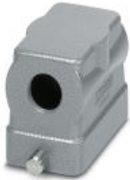
HEAVYCON B6 sleeve housing, for single locking latch, height: 56 mm, with 1 x M25 thread, lateral cable outlet

Please be informed that the data shown in this PDF Document is generated from our Online Catalog. Please find the complete data in the user's documentation. Our General Terms of Use for Downloads are valid ( http://phoenixcontact.com/download )