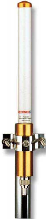
FG821/18503 (Shown with optional FM2SP mounting kit)